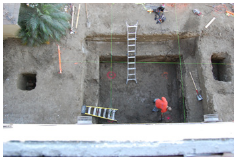
Aerial view of the elevator pit