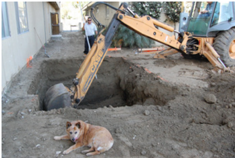
Excavating the elevator pit – 7 feet deep

As you look at the aerial picture of the elevator pit, you will notice two other excavated holes. The hole on the right is for the metal post to hold the metal canopy for covering the walkway to the patio area. There are another 8 more holes to be excavated for the canopy. The hole on the left is for a sewer clean out.