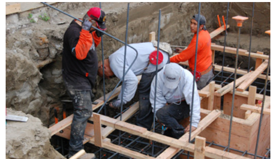
The men are tying the steel dowels to form the reinforcing cage.