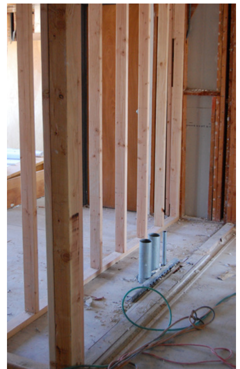
Roughed in data room