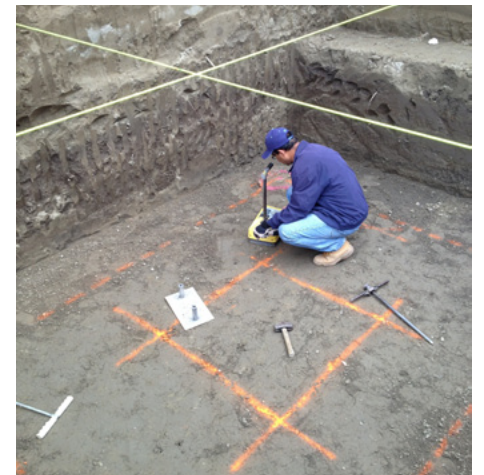
Soil engineer from Geo Environ Soil Engineers test the compaction of the soil at the bottom of the elevator pit.