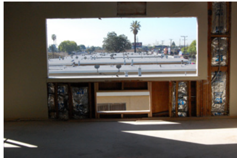
Old windows removed and the HVAC opening roughed in